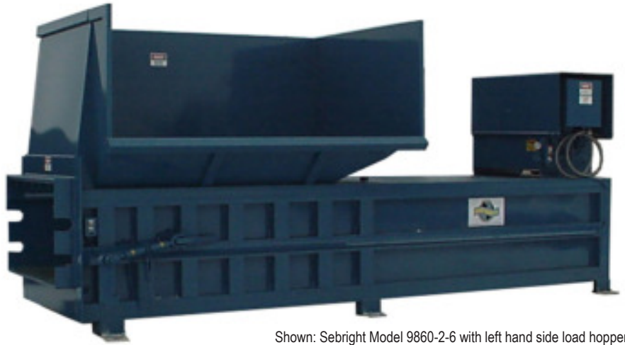
Shown: Sebright Model 9860-2-6 with left hand side load hopper, deck mounted power unit with cover, and optional pinning tunnel holes

Extra heavy duty frame and ram -- heavy structural plate with ship and car channel construction.